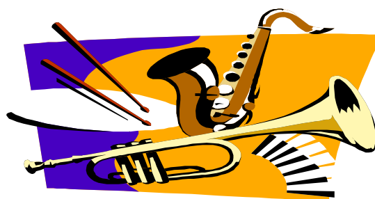
What is going on?

Well that is all. I look forward to this opportunity of