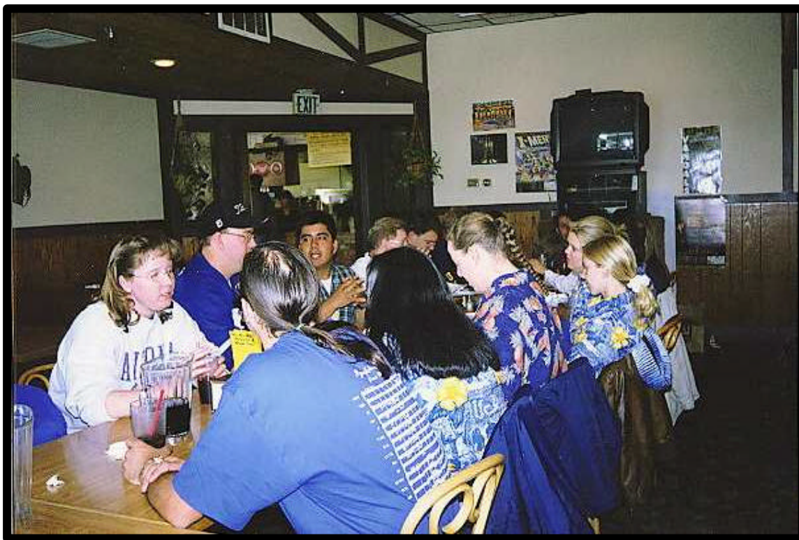
Alumni Lunch – Boise, Idaho

The winning logo will be unveiled at the 2000 WD Convention!